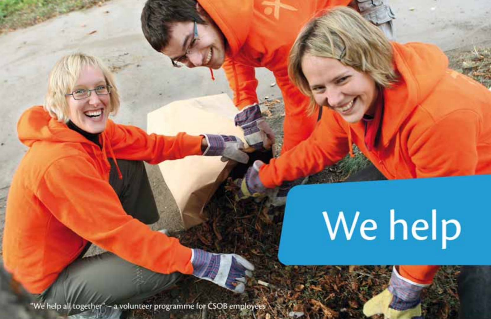
"We help all together" – a volunteer programme for ČSOB employees